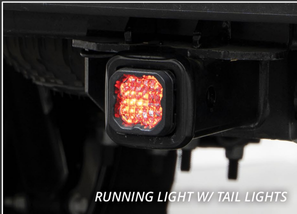
RUNNING LIGHT W/ TAIL LIGHTS