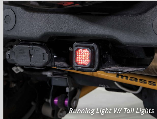
Running Light W/ Tail Lights