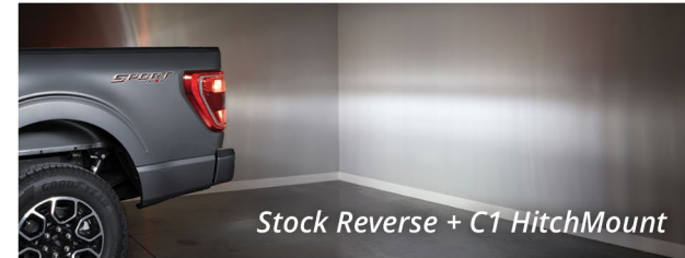
Stock Reverse + C1 HitchMount