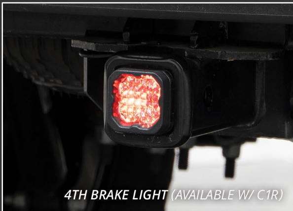
4TH BRAKE LIGHT (AVAILABLE W/ C1R)