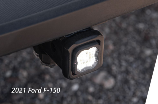
2021 Ford F-150