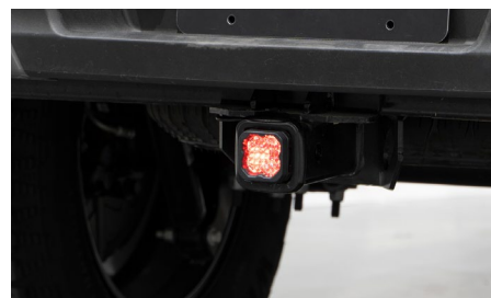
HitchMount - Fourth Brake Light (available w/ C1R)