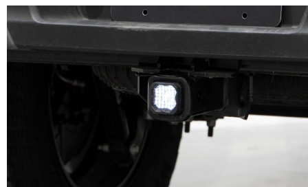
HitchMount - Reverse Light