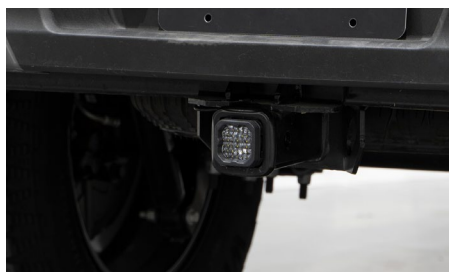
HitchMount - Off