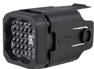
HitchMount - Front