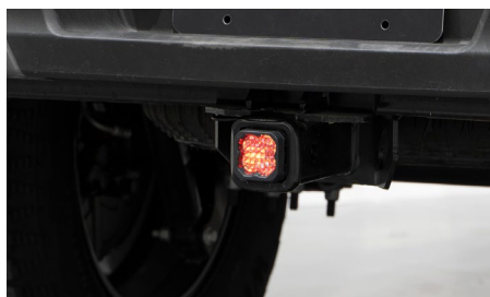
HitchMount - Running Light w/ Tail Lights