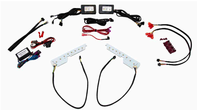
Lower DRL Boards Kit