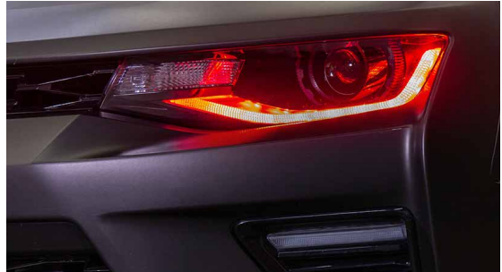
Upper RGBW/RGBWA DRL Boards