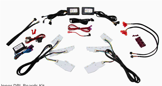
Upper DRL Boards Kit