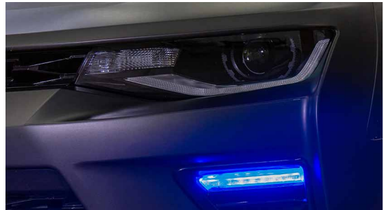
Lower RGBW/RGBWA DRL Boards