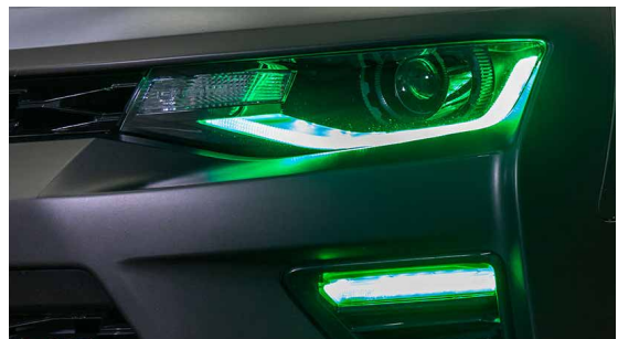
Upper and Lower RGBW/RGBWA DRL Boards